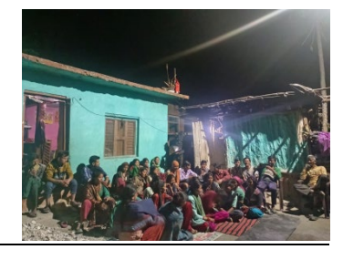
Study team members